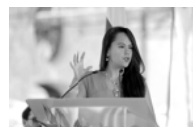
Geannina Dinarte Romero Minister of Work and Social Security Republic of Costa Rica