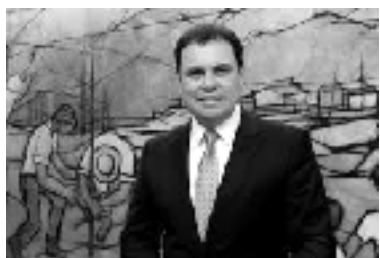
Carlos Ricardo Benavides President of the Parliament Republic of Costa Rica